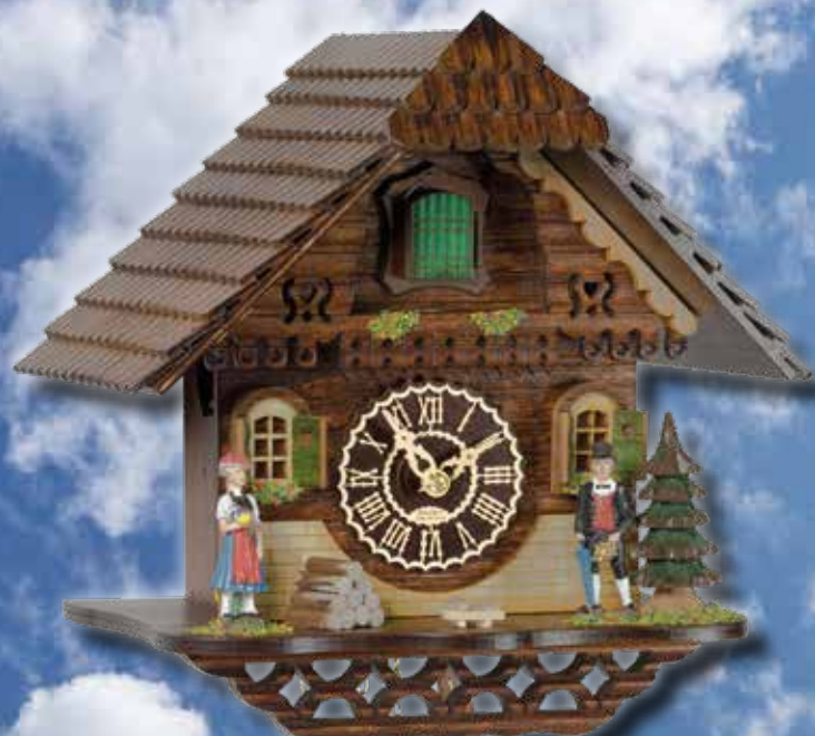
1510 1-Tag/1 day/1 jour 24 cm = 9 3/5"