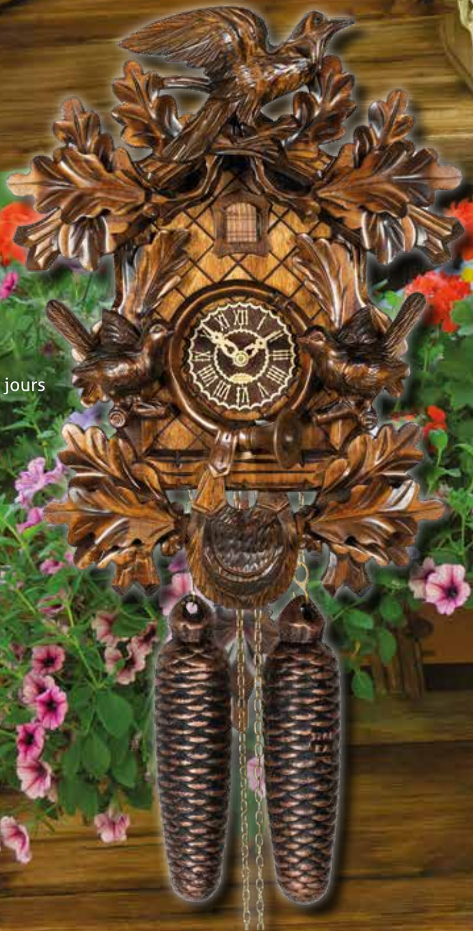
8367/4 nu 8-Tage/8 days/8 jours 44 cm = 17 3/5"