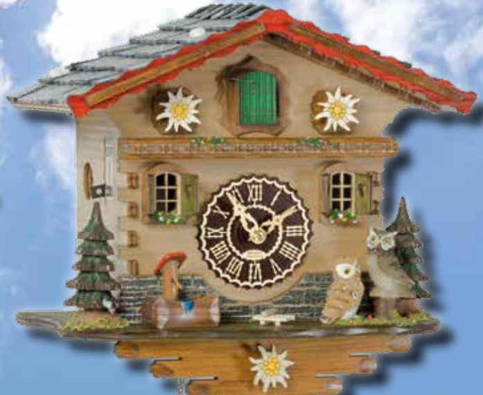
1514 1-Tag/1 day/1 jour 20 cm = 8"