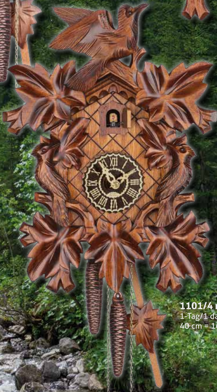
1101/4 nu 1-Tag/1 day/1 jour 40 cm = 16"