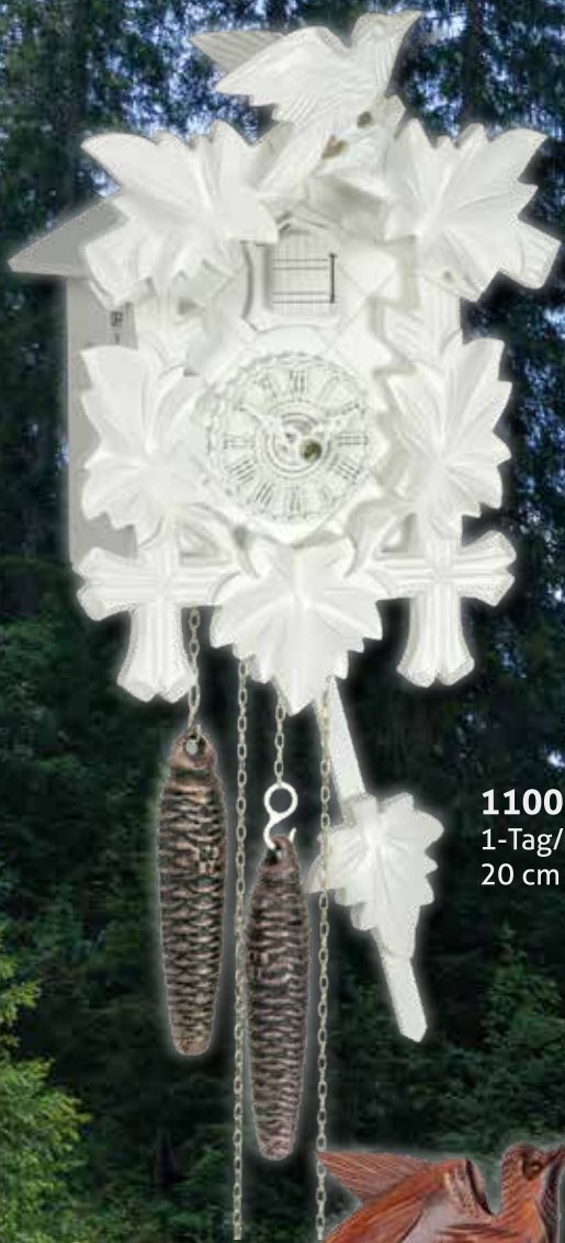
1100 weiss 1-Tag/1 day/1 jour 20 cm = 8"