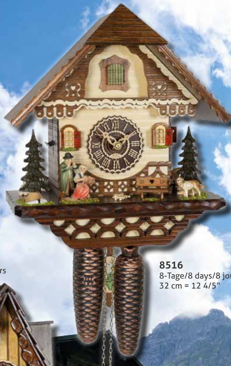
8516 8-Tage/8 days/8 jours 32 cm = 12 4/5"