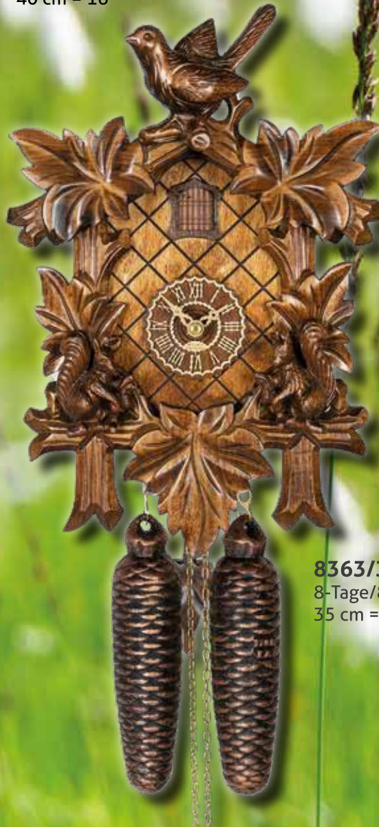
8363/3nu 8-Tage/8 days/8 jours 35 cm = 14"