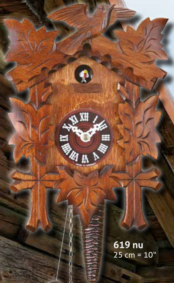
619 nu 25 cm = 10"