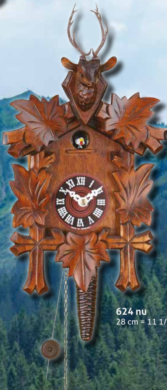
624 nu 28 cm = 11 1/5"