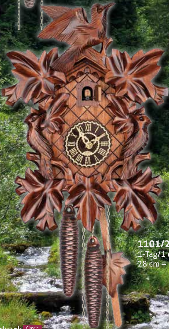
1101/2 nu 1-Tag/1 day/1 jour 28 cm = 11 1/5"