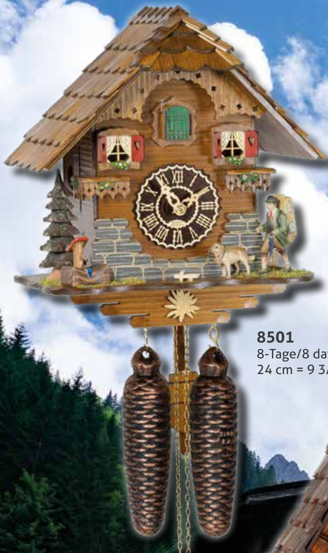
8501 8-Tage/8 days/8 jours 24 cm = 9 3/5"