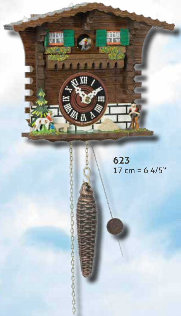
623 17 cm = 6 4/5"