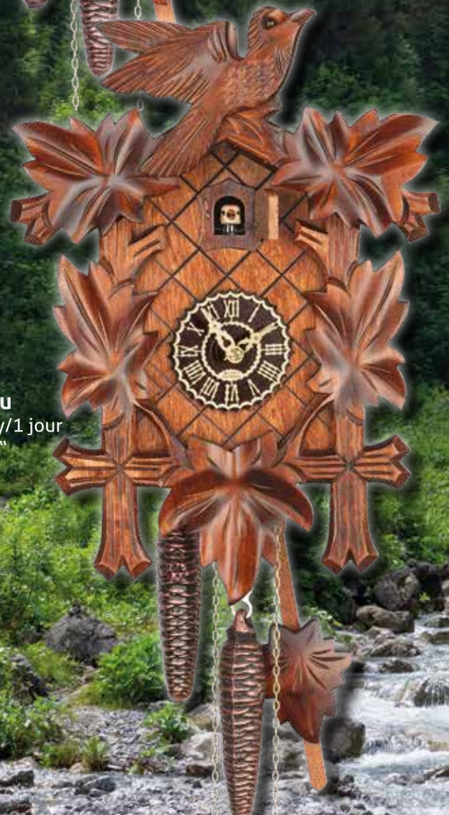
1100/3 nu 1-Tag/1 day/1 jour 35 cm = 14"