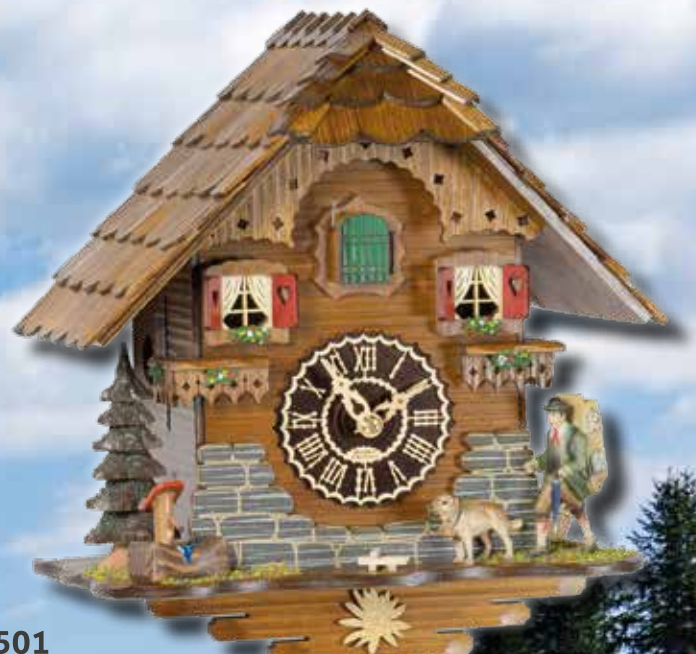
1501 1-Tag/1 day/1 jour 24 cm = 9 3/5"