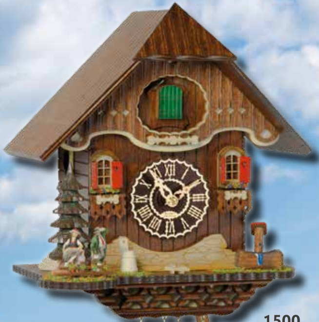
1500 1-Tag/1 day/1 jour 24 cm = 9 3/5"