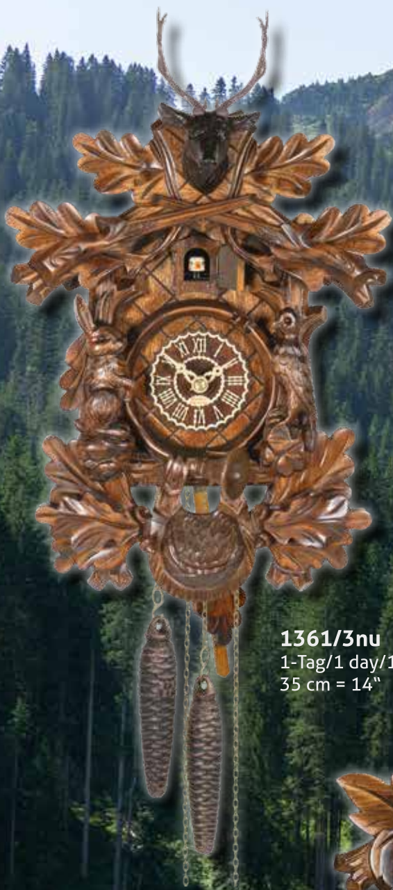
1361/3nu 1-Tag/1 day/1 jour 35 cm = 14"