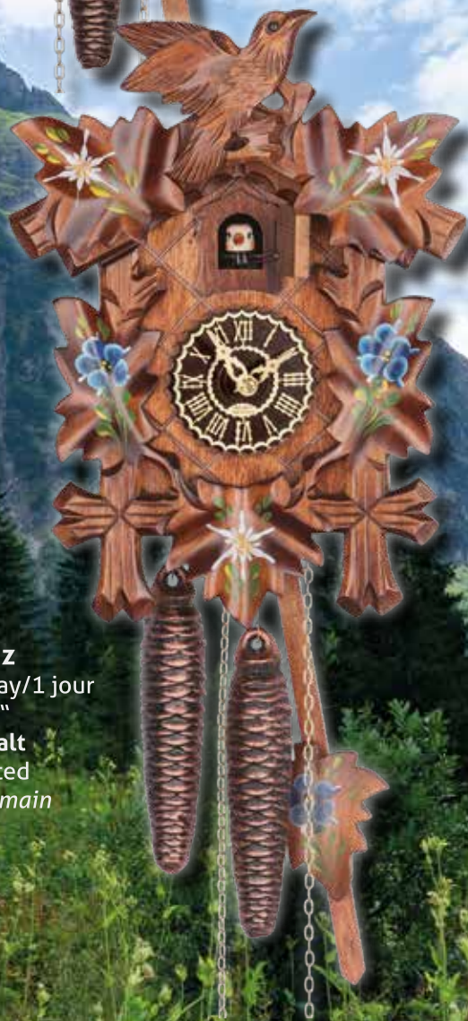
1100 enz 1-Tag/1 day/1 jour 20 cm = 8" handbemalt handpainted peint à la main