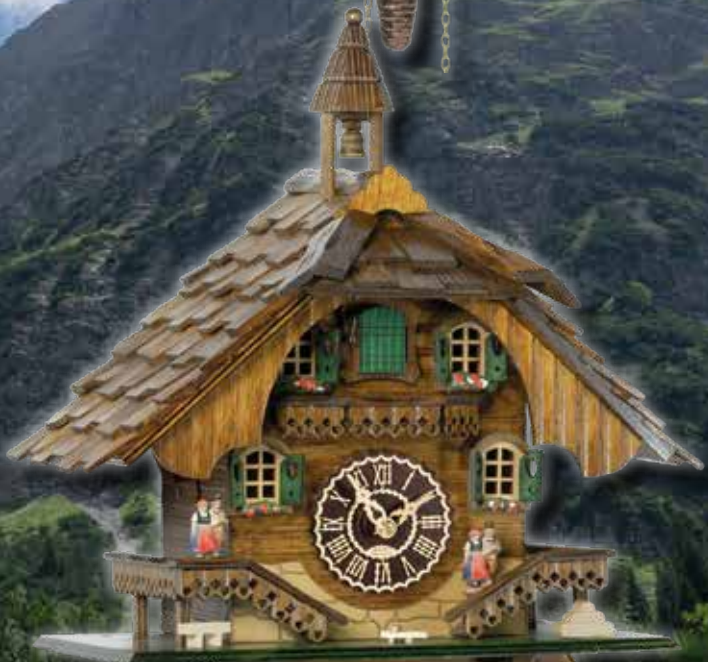
1515 1-Tag/1 day/1 jour 29 cm = 11 3/5"