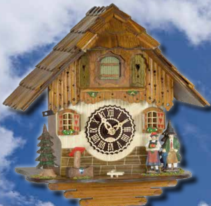
1509 1-Tag/1 day/1 jour 25 cm = 10"