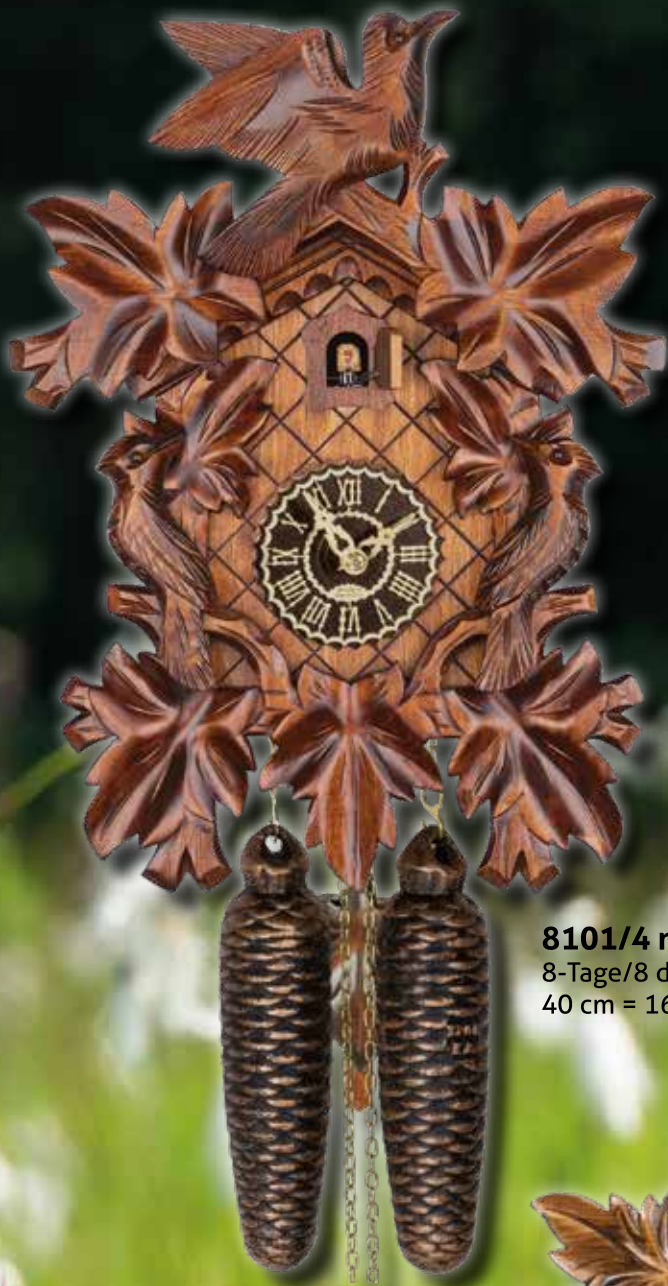
8101/4 nu 8-Tage/8 days/8 jours 40 cm = 16"