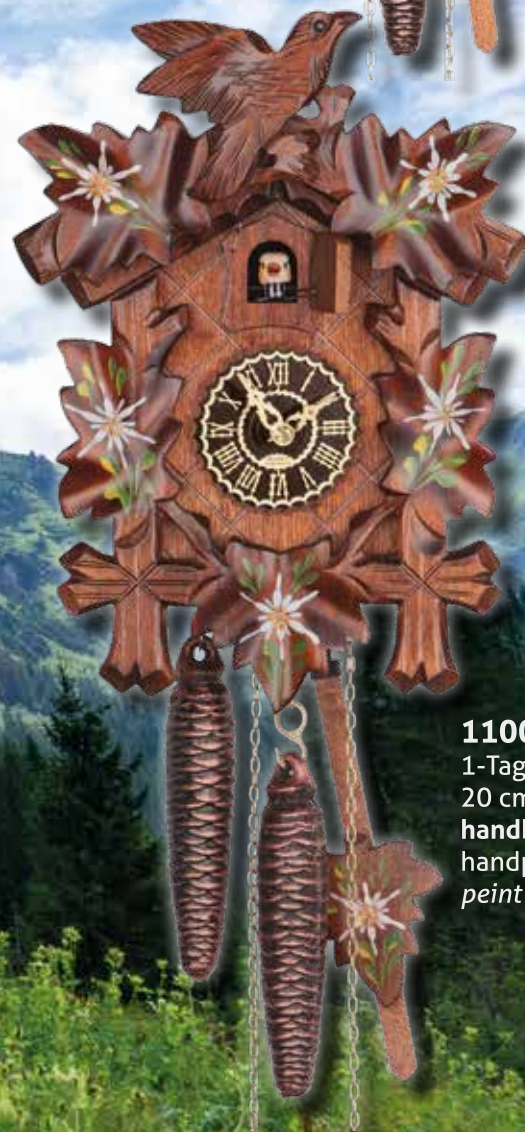
1100 ed 1-Tag/1 day/1 jour 20 cm = 8" handbemalt handpainted peint à la main