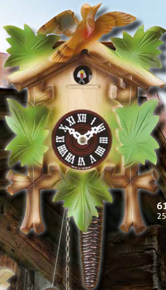
619 bunt 25 cm = 10"