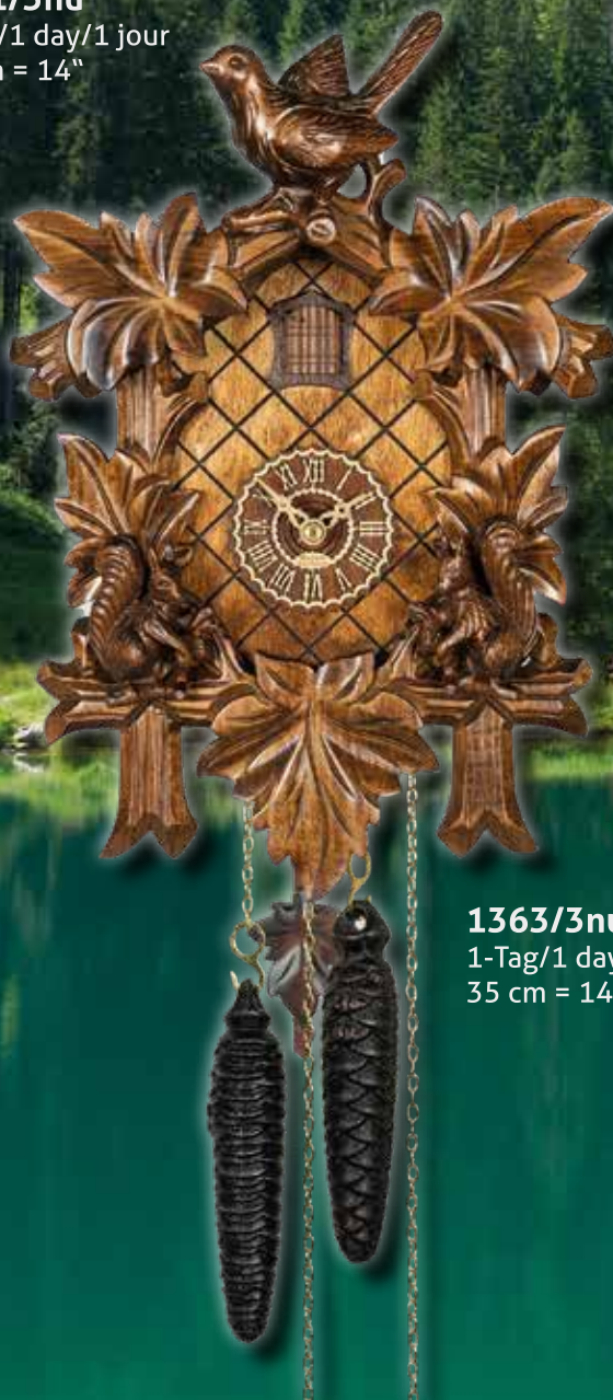
1363/3nu 1-Tag/1 day/1 jour 35 cm = 14"