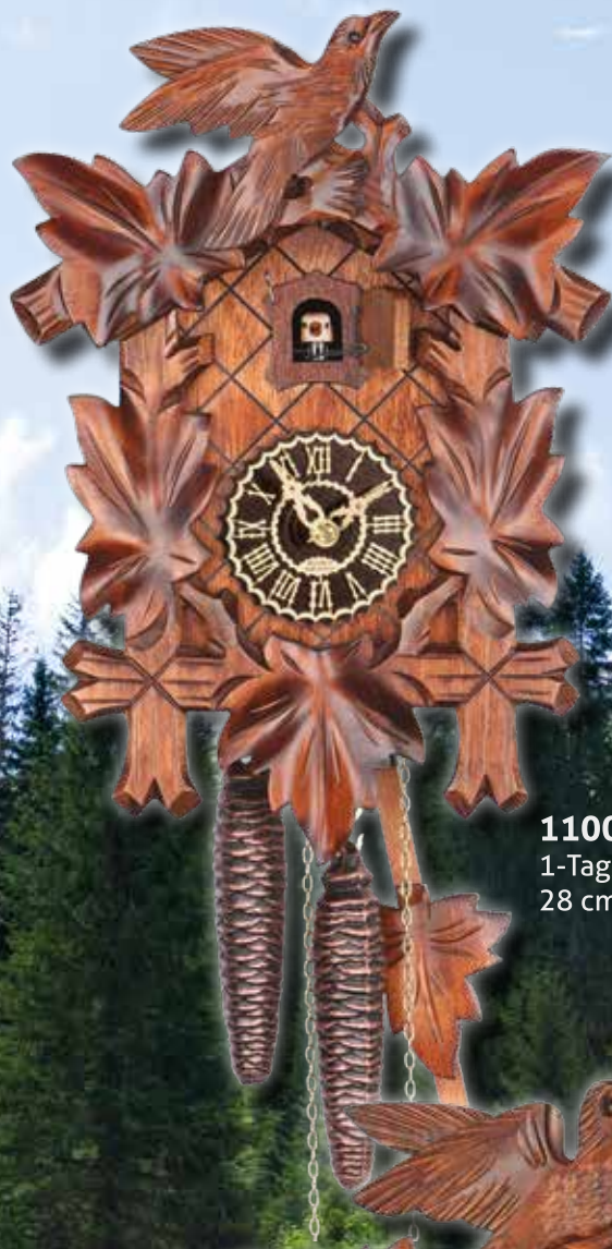
1100/2 nu 1-Tag/1 day/1 jour 28 cm = 11 1/5"