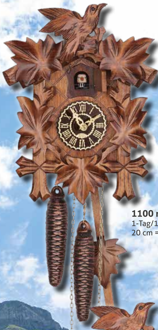
1100 nu 1-Tag/1 day/1 jour 20 cm = 8"