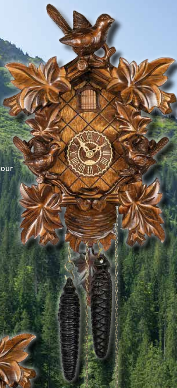
1362/3nu 1-Tag/1 day/1 jour 35 cm = 14"