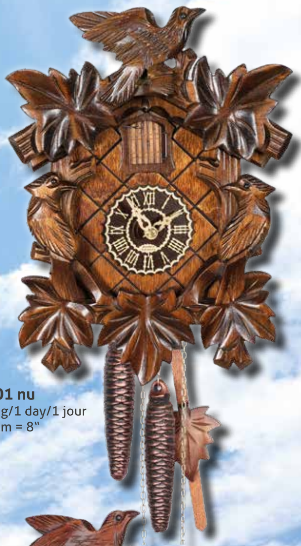
1101 nu 1-Tag/1 day/1 jour 20 cm = 8"