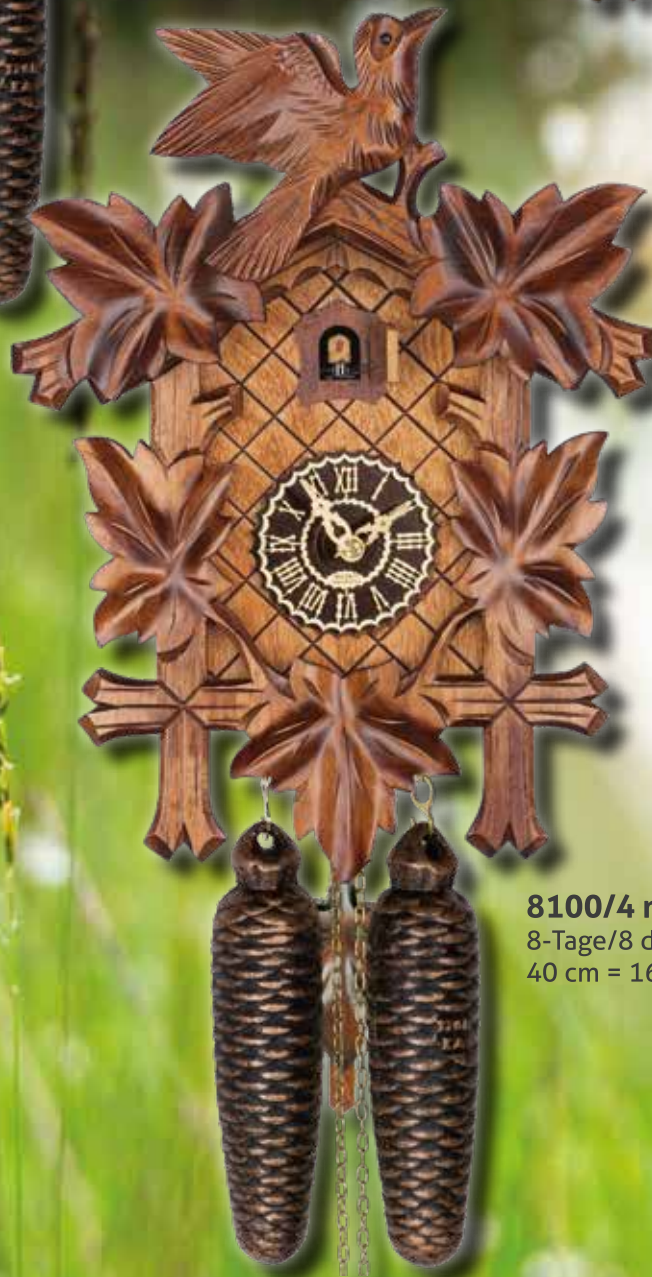
8100/4 nu 8-Tage/8 days/8 jours 40 cm = 16"