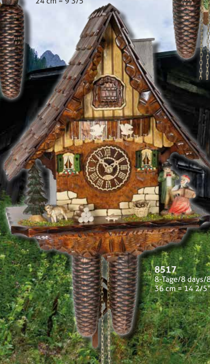
8517 8-Tage/8 days/8 jours 36 cm = 14 2/5"