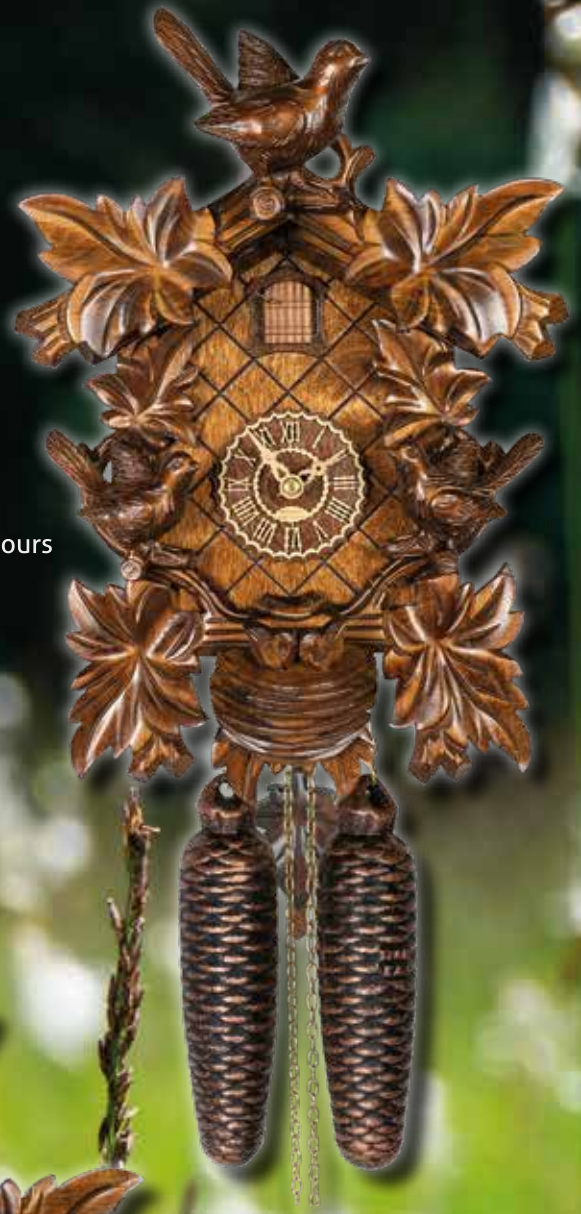
8362/3nu 8-Tage/8 days/8 jours 35 cm = 14"