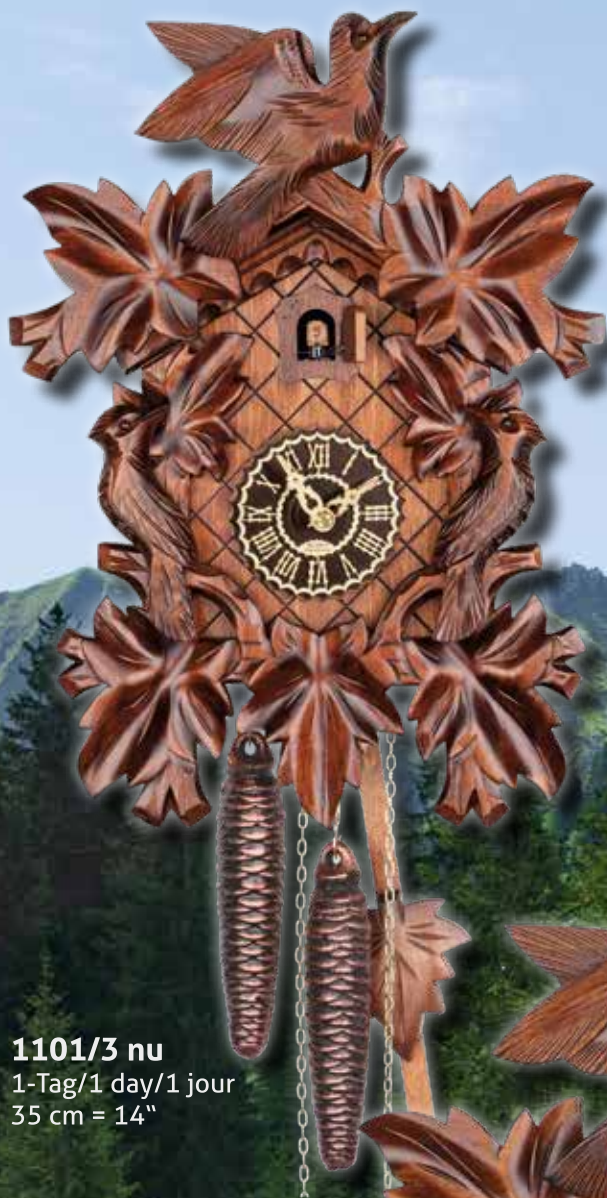
1101/3 nu 1-Tag/1 day/1 jour 35 cm = 14"