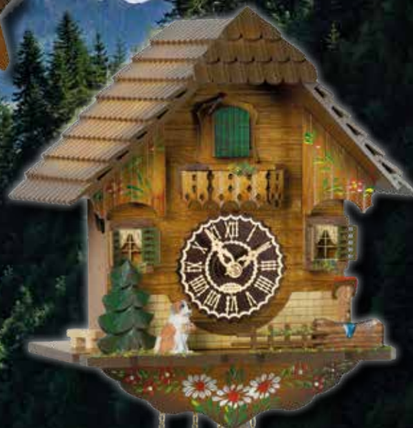
1502 1-Tag/1 day/1 jour 22 cm = 8 4/5" handbemalt handpainted peint à la main