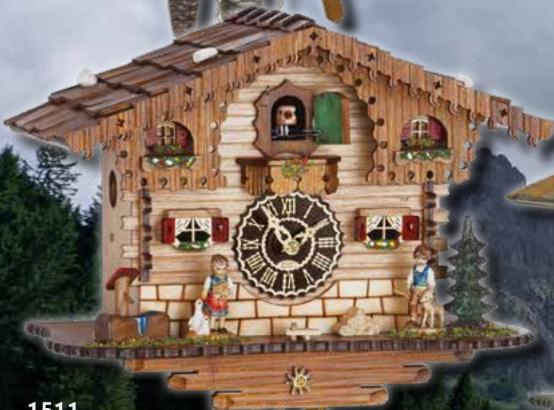
1511 1-Tag/1 day/1 jour 22 cm = 8 4/5"