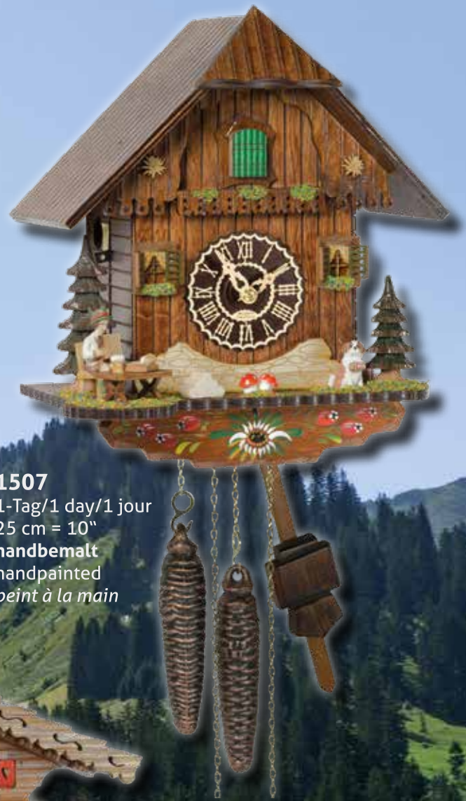
1507 1-Tag/1 day/1 jour 25 cm = 10" handbemalt handpainted peint à la main