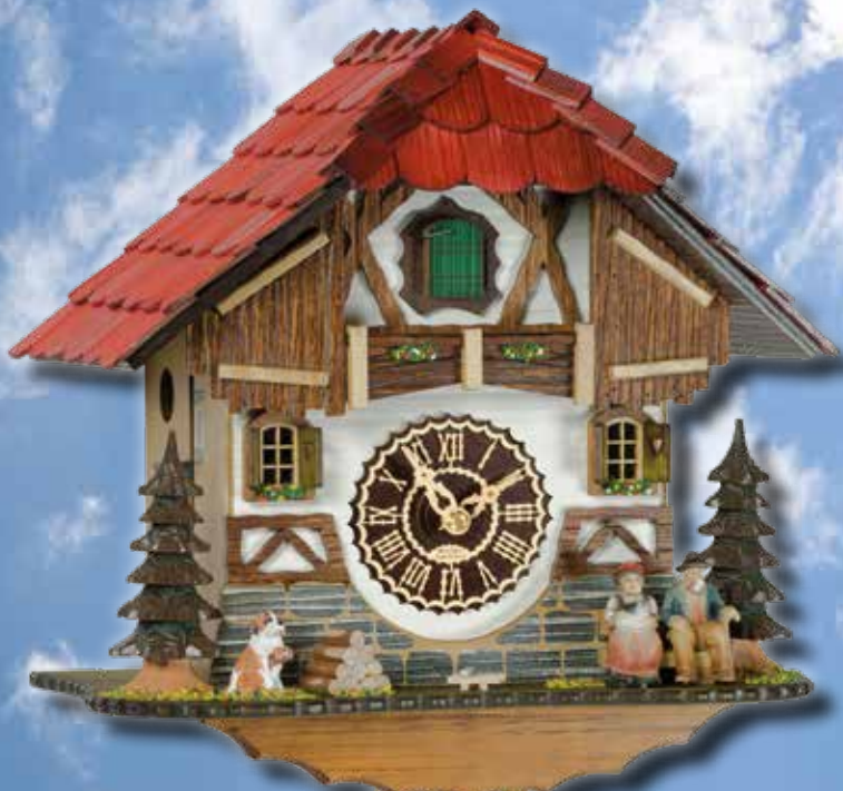
1513 1-Tag/1 day/1 jour 27 cm = 10 4/5"