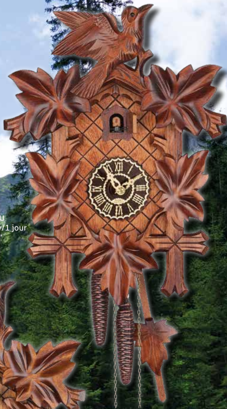
1100/4 nu 1-Tag/1 day/1 jour 40 cm = 16"