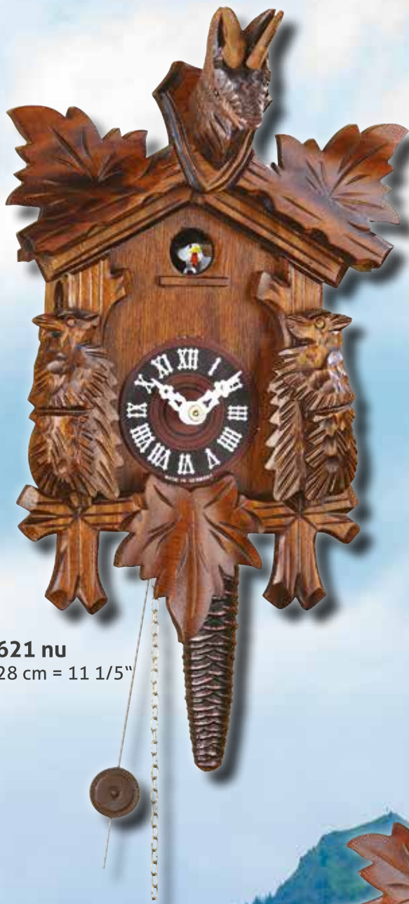
621 nu 28 cm = 11 1/5"