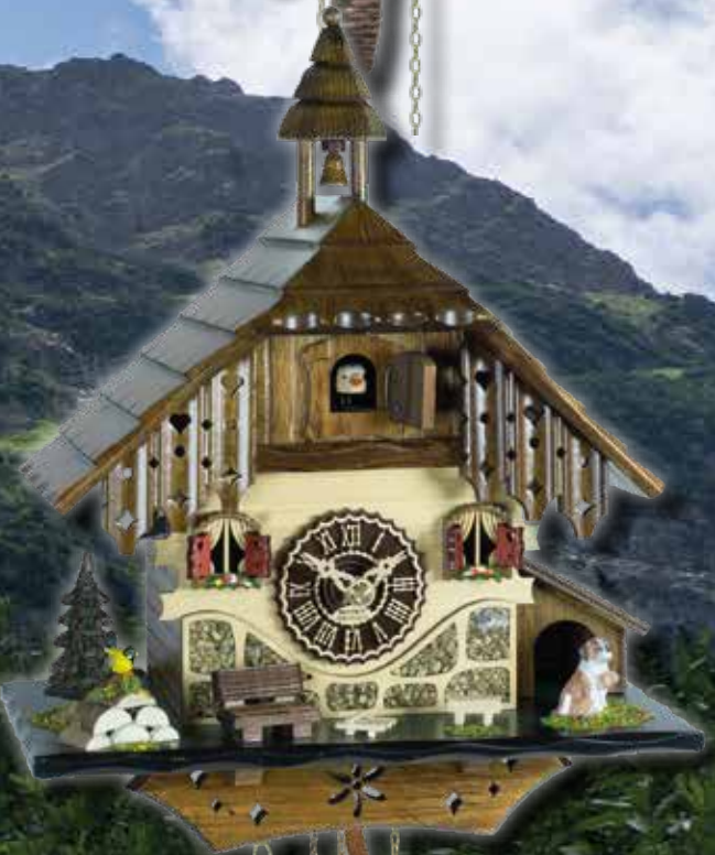
1518 1-Tag/1 day/1 jour 29 cm = 11 3/5"