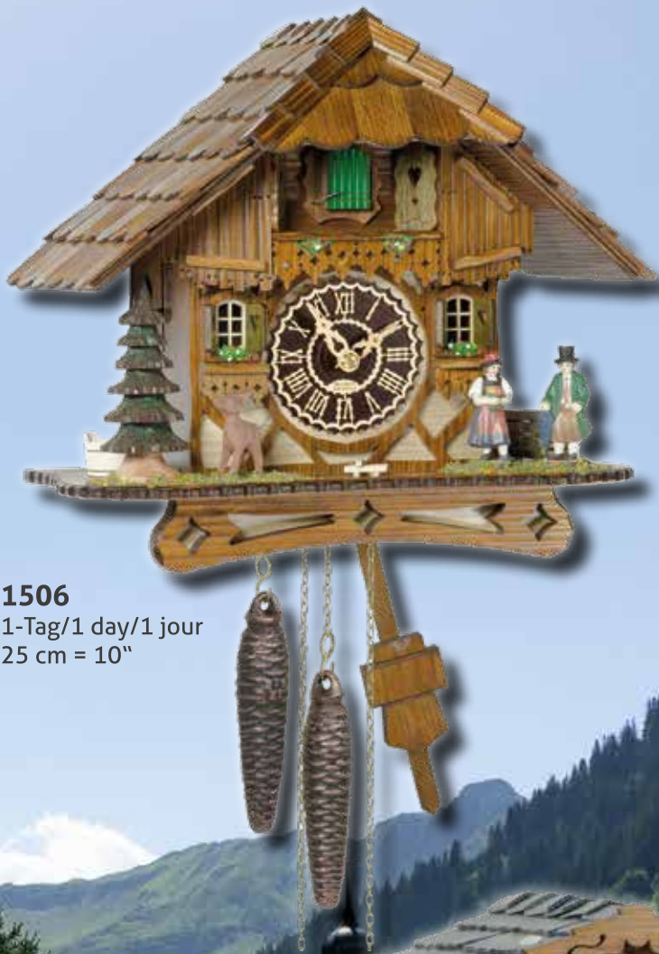
1506 1-Tag/1 day/1 jour 25 cm = 10"