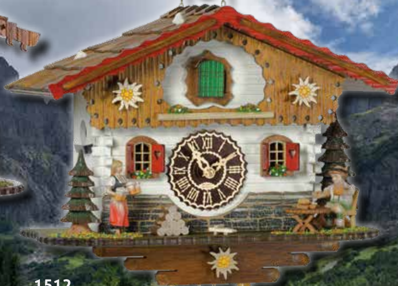
1512 1-Tag/1 day/1 jour 22 cm = 8 4/5"