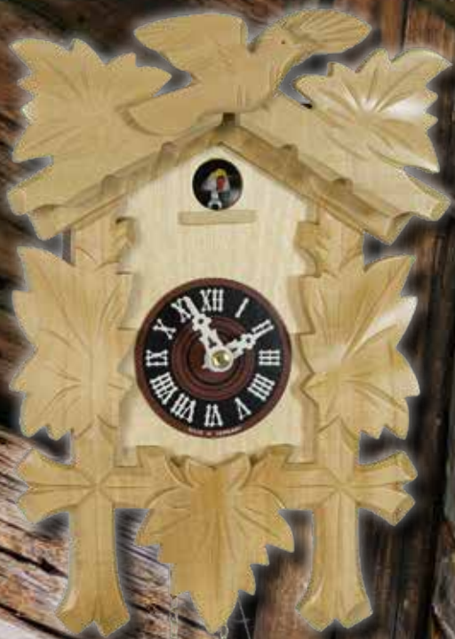
619 natur 25 cm = 10"